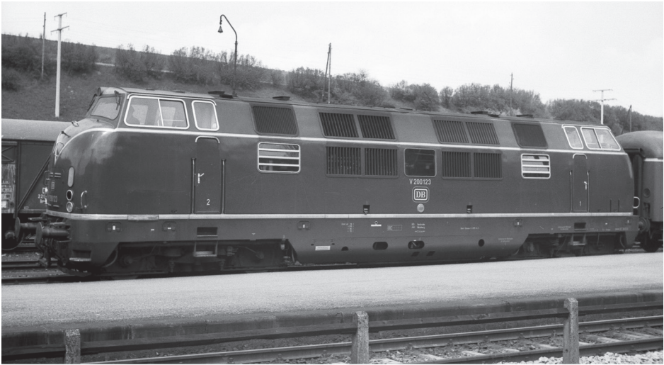
V 200 123 in Rottweil im Mai 1965

Although the machines of the V 200.0 proved themselves very well, at the end of the 1950s, due to the increased volume of traffic, it became necessary to procure a more powerful advanced series for the fast and heavy passenger train service.