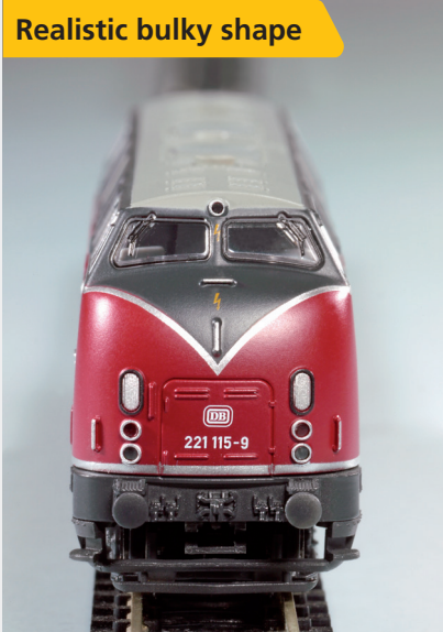
Realistic bulky shape